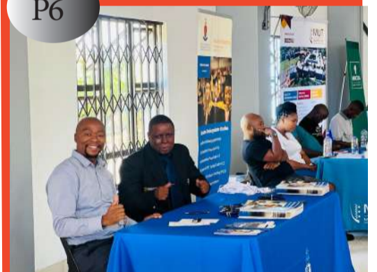
Igantsha le-UCCSA lase Nanda nohlelo lwe career days