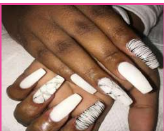
GEL & ACRYLIC NAILS

WIGS BRAIDED TO FIT YOUR HEAD FROM AS LITTLE AS R100 ALL TYPES OF BRAIDS TO SUIT YOUR NEED