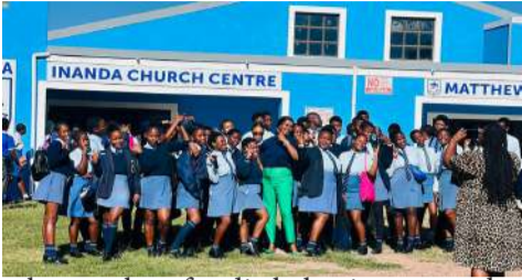
abanye abamfundi abebeyinxenye yalehlelo lokuchazela kabanzi abafundi ngemisebenzi abangayifundela (Career Exposure)